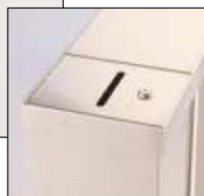
PT100-T (ticket box)